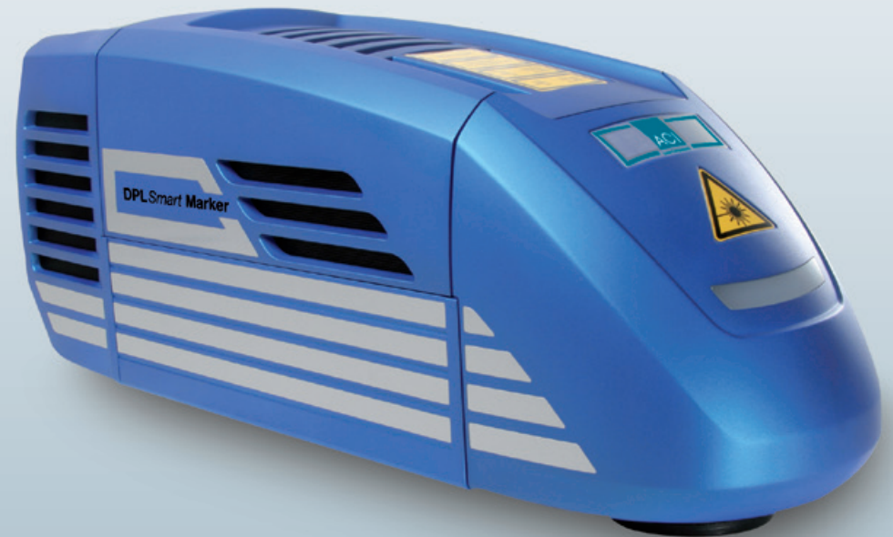
DPL Smart Marker

28.700,- EUR excl. VAT software included